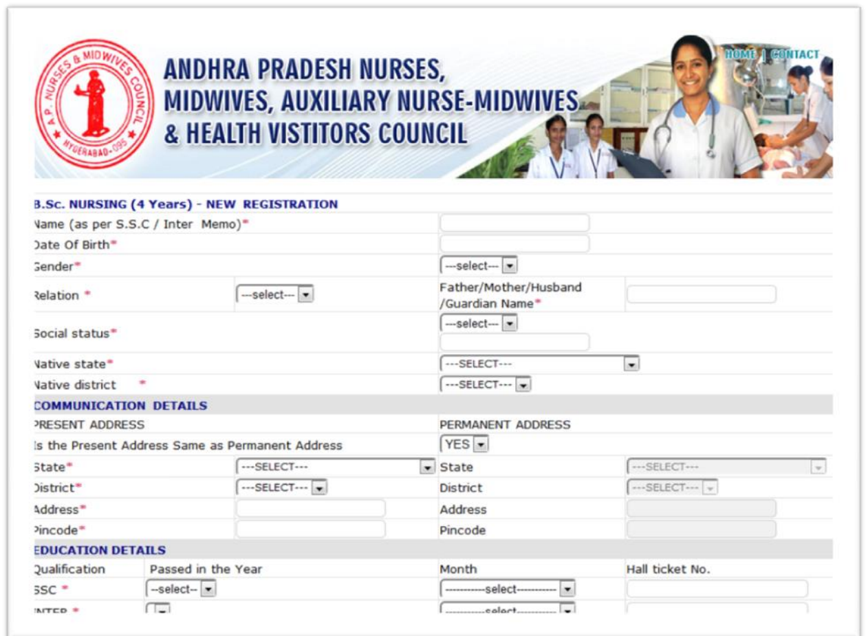
Figure 2: Registration Form

Example Registration at figure 2: After you fill all the details click on submit.